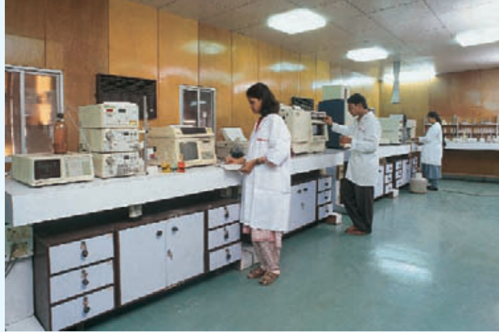
Advanced Instrument Lab