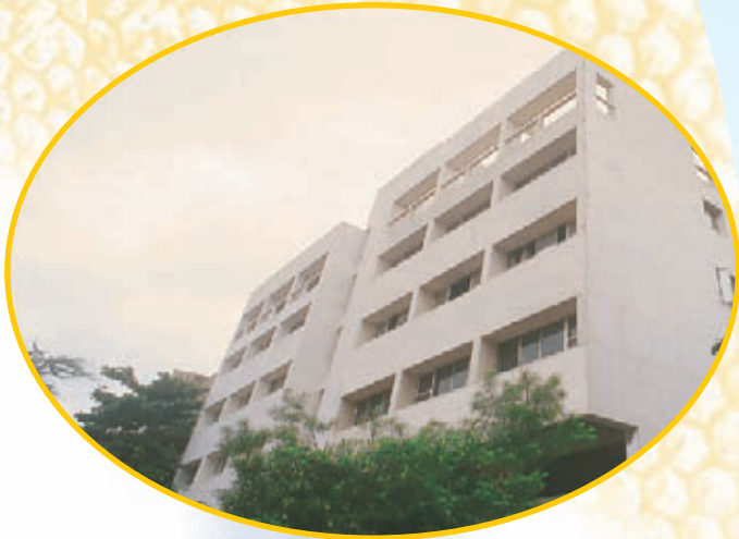
Paramount Corporate Office