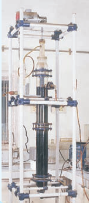
Lab Scale UASB Reactor